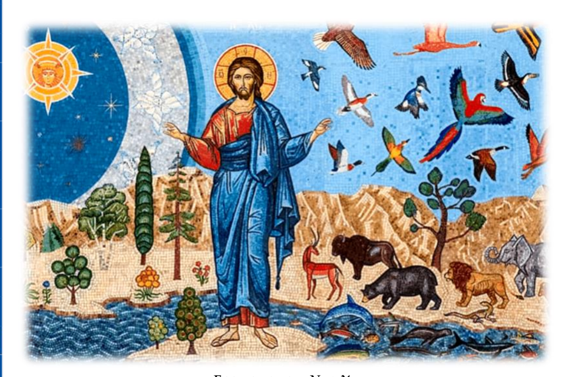
~ECCLESIASTICAL NEW YEAR~